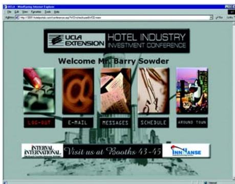
Sample: Convention Portal Home Page

QuickSilver appliances are the ideal way to provide hotel guests with instant access to the Internet at blazing speed. Easy-to-use, easy-to-maintain, just like the TV and Telephone. And just like the TV and Telephone, the QuickSilver appliance is sure to become an indispensable fixture in your rooms.