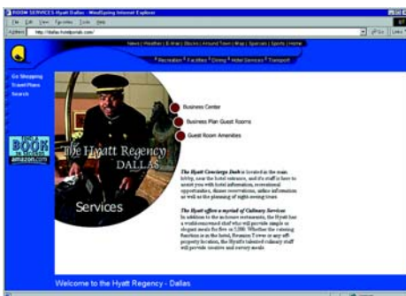
Sample: Hotel Portal Services Page