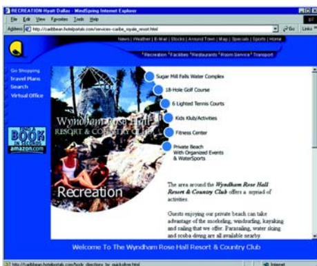
Sample: Hotel Portal Recreation Page